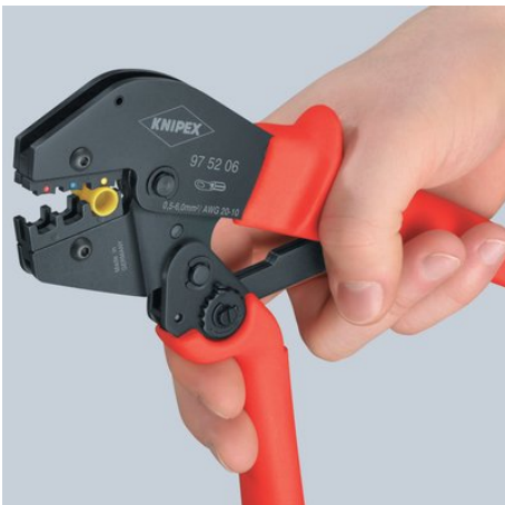
First step: move the handle with two fingers only until both jaws touch the connector to be crimped