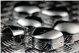
Steel toe cap