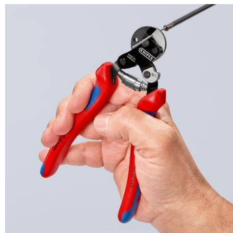
For cutting high-strength wire ropes (1960 N/mm 2 ) with a diameter of up to 4 mm